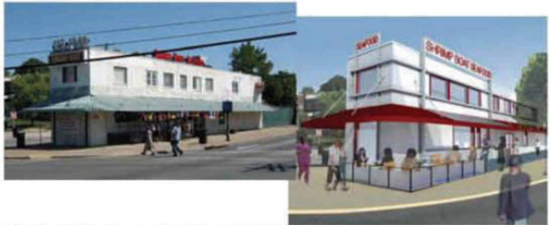
Before photo (left) and completed project rendering for the Shrimp Boat located at East Capitol Street and Benning Road NE.

throughout the city. Once the construction was completed, the small businesses reported an increase in revenue.